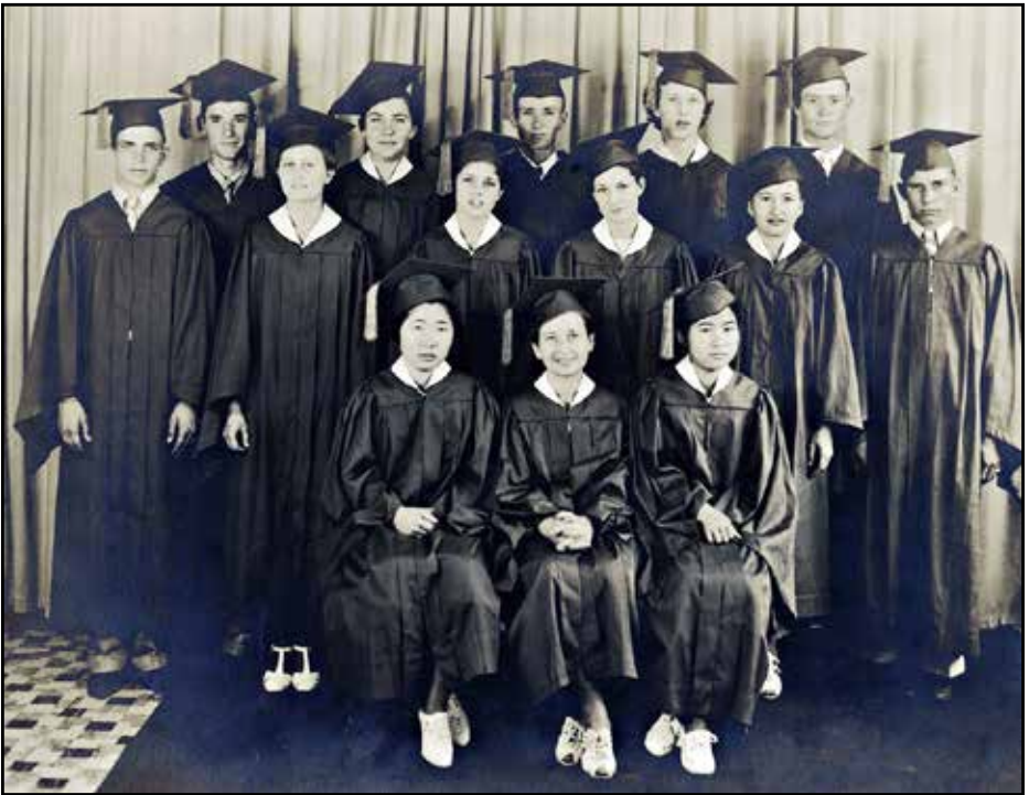
Fannett High School Seniors Class of 1937