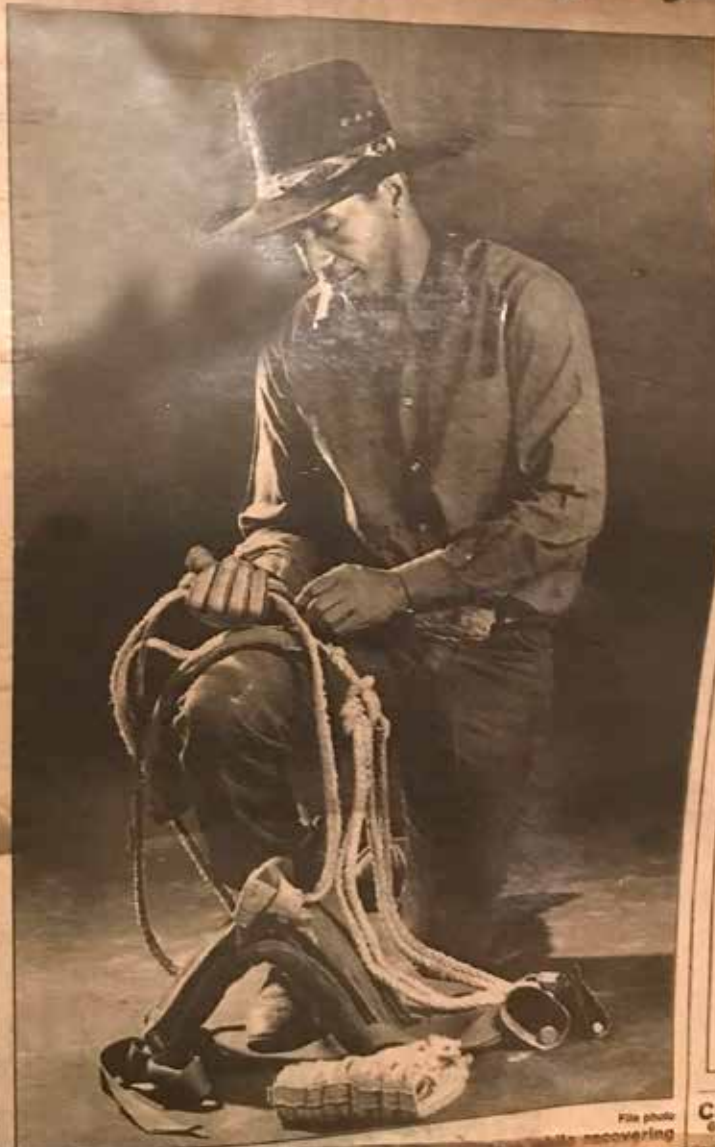
File photo Gutts recovering

"It is supposed to be six or eight months before I can ride again," he said. "I have made enough money