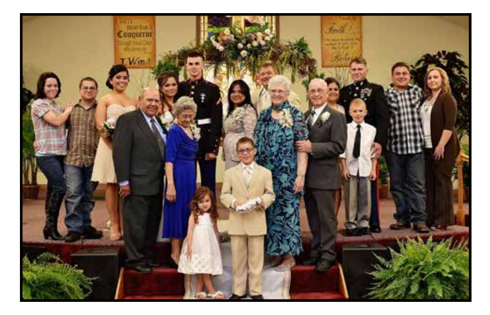
"I have fought a good fight, I have finished my course, I have kept the faith." 2 Timothy 4:7