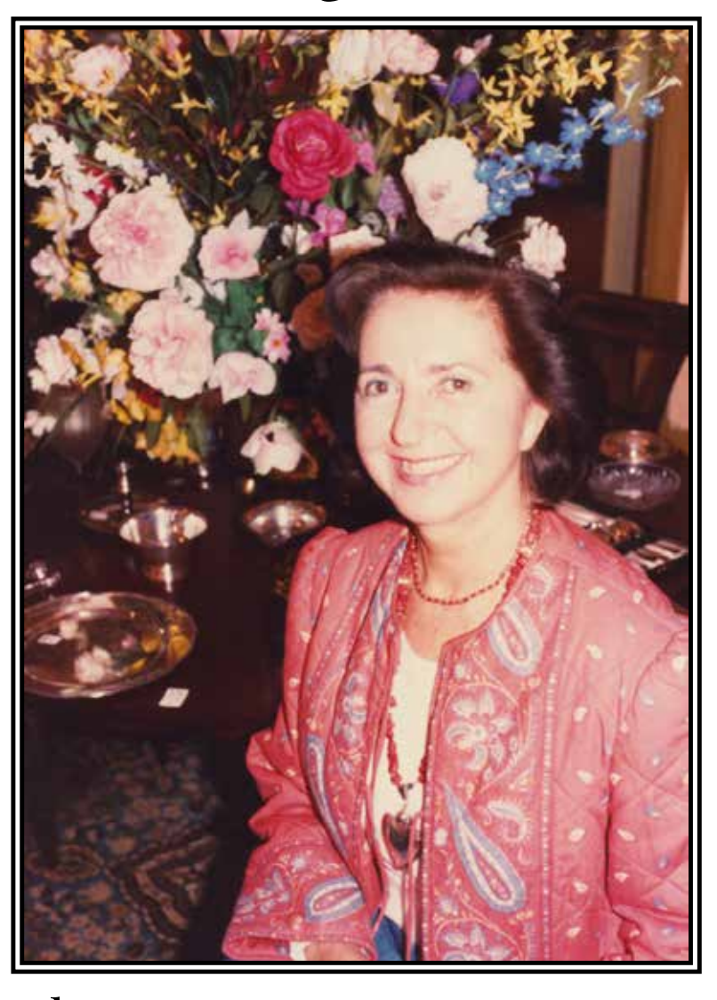
February 12, 1923 - May 9, 2019 "La Vie En Rose Pour Toujours"