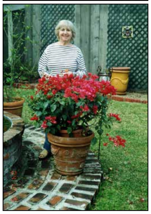
Non, je ne regrette rien