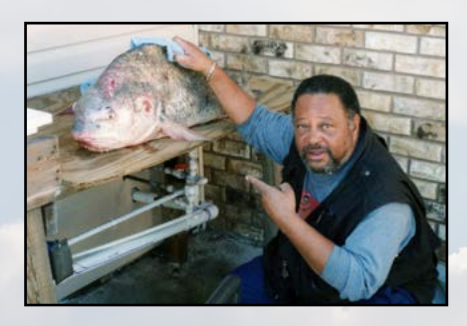
The Twenty-Third Psalm

With tearful eyes we watched him suffer, and saw him slowly fade away. Although we loved him dearly, we could not make him stay. A golden heart stopped beating, hard working hands put to rest, God broke our hearts to prove to us, He only takes the best.