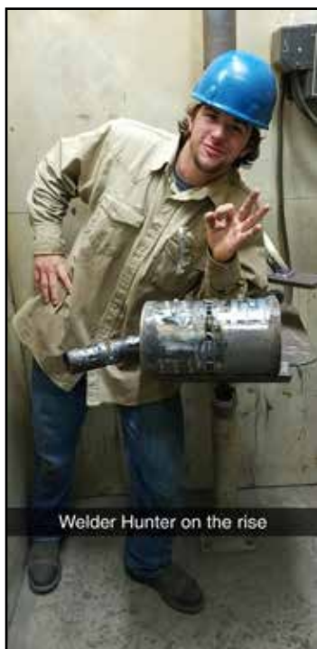
Welder Hunter on the rise