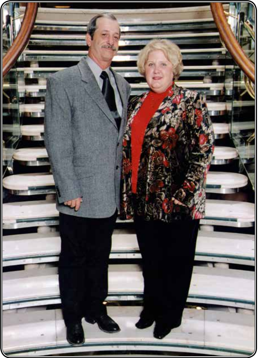
Tommy Gene Overstreet March 8, 1954 - February 6, 2018