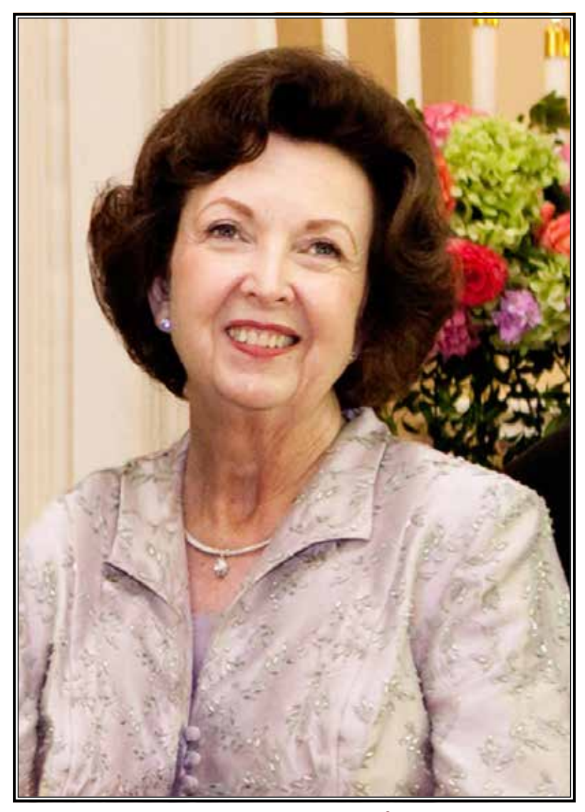
ST. ANDREW'S PRESBYTERIAN CHURCH BEAUMONT, TEXAS

Service of Witness to the Resurrection for