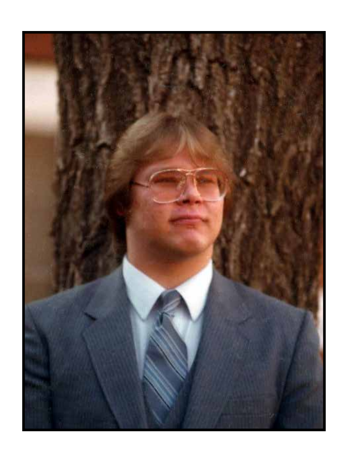
Committal Broussard's Crematorium Beaumont, Texas