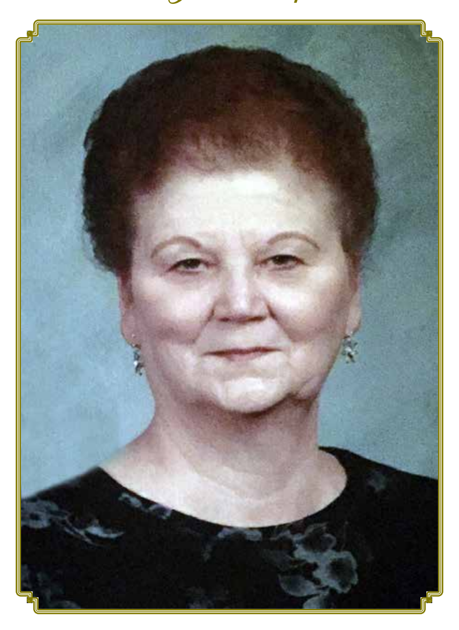
April 12, 1937 - December 28, 2017