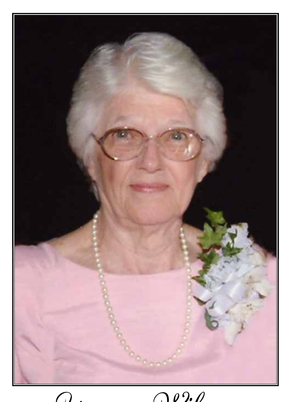
July 22, 1922 - October 9, 2019