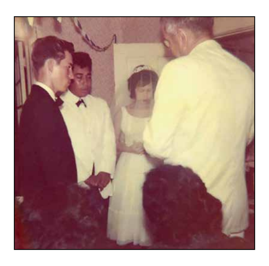
The Twenty-Third Psalm

The Lord is my Shepherd, I shall not want. He maketh me to lie down in green bastures: He leadeth me beside the still waters. He restoreth my soul. He leadeth me in the path of righteousness for His name's sake. Yea, though I walk through the valley of the shadow of death. I will fear no evil: for Thou art with me: Thy rod and Thy staff they comfort me. Thou preparest a table before me in the presence of mine enemies. Thou anointest my head with oil: my cup runneth over. Surely goodness and mercy shall follow me all the days of my life; and I will dwell in the house of the Lord forever.