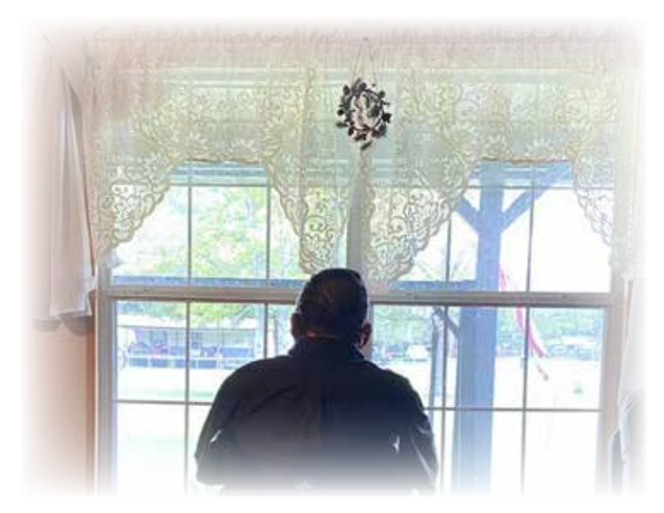
"I have fought a good fight, I have finished my course, I have kept the faith." 2 Timothy 4