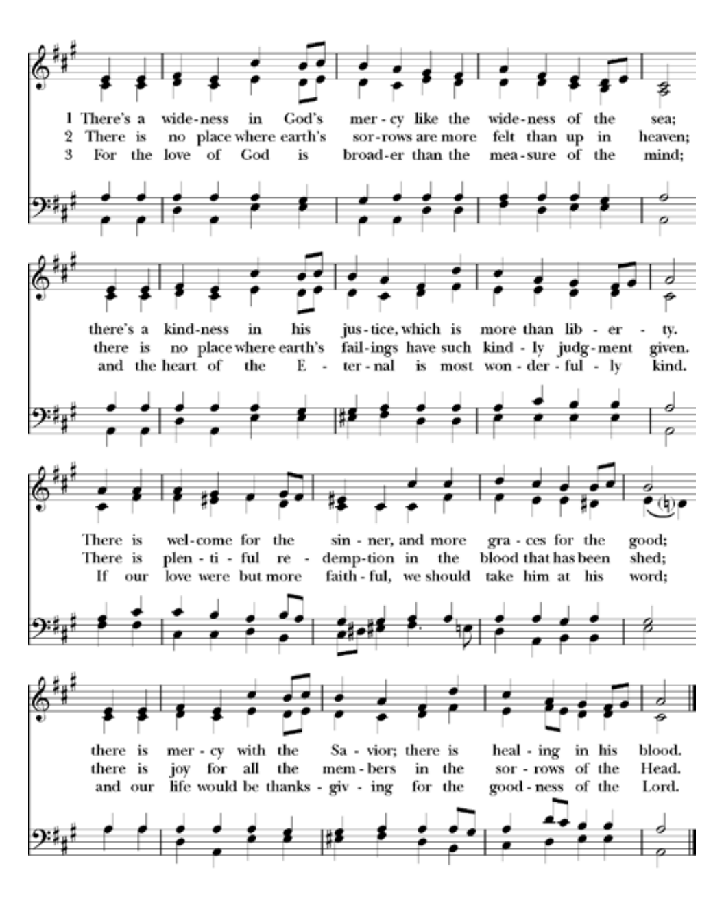
Opening Hymn "There's a wideness in God's mercy" Hymnal 470 ( Please stand and join in singing. )