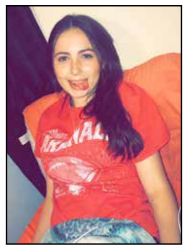
"An angel flying too close to the ground"