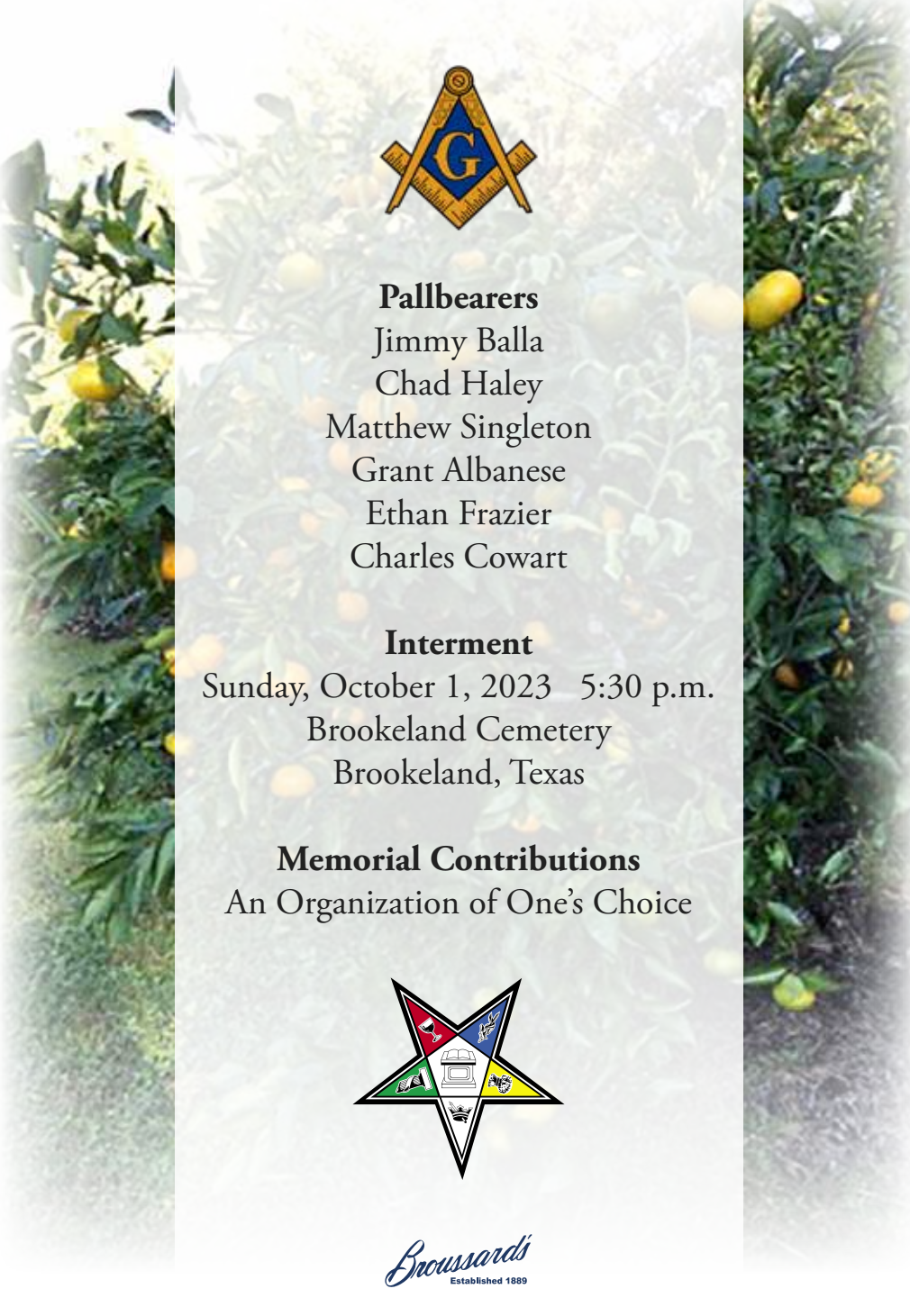
Please sign Doyle's guest book and share your memories at broussards1889.com