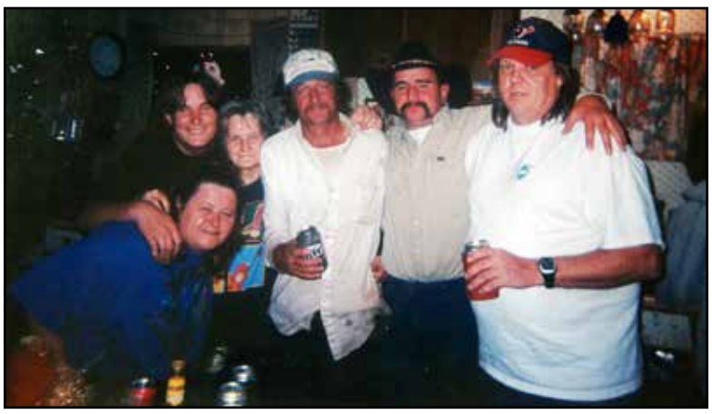
"A father, son, and brother's prayer to his family"

A limb has fallen from the family tree You'll keep hearing a voice that says, "Grieve not for me." Remember the best times, the laughter, the song. The good life I lived while I was Strong. Continue my heritage, I'm counting on you. Keep smiling and surely the sun will shine through. My mind is at ease, my soul at rest. Remembering all, how I truly was blessed. Continue traditions, no matter how small. Go on with your life, don't worry about falls. I miss you all dearly, so keep up your chin Until the day we are together again.