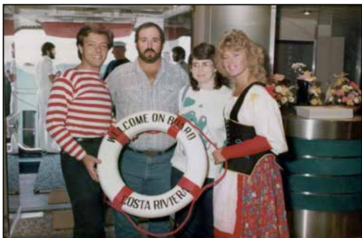
CostaRiviera CRUISING ITALIAN STYLE 316