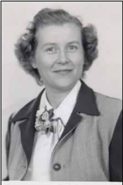
SOUTH PARK ELEM.