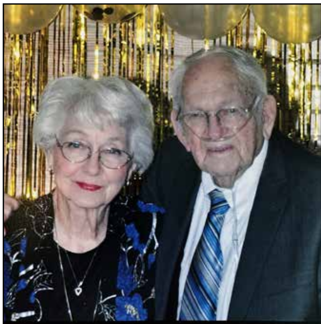
70th Anniversary Celebration